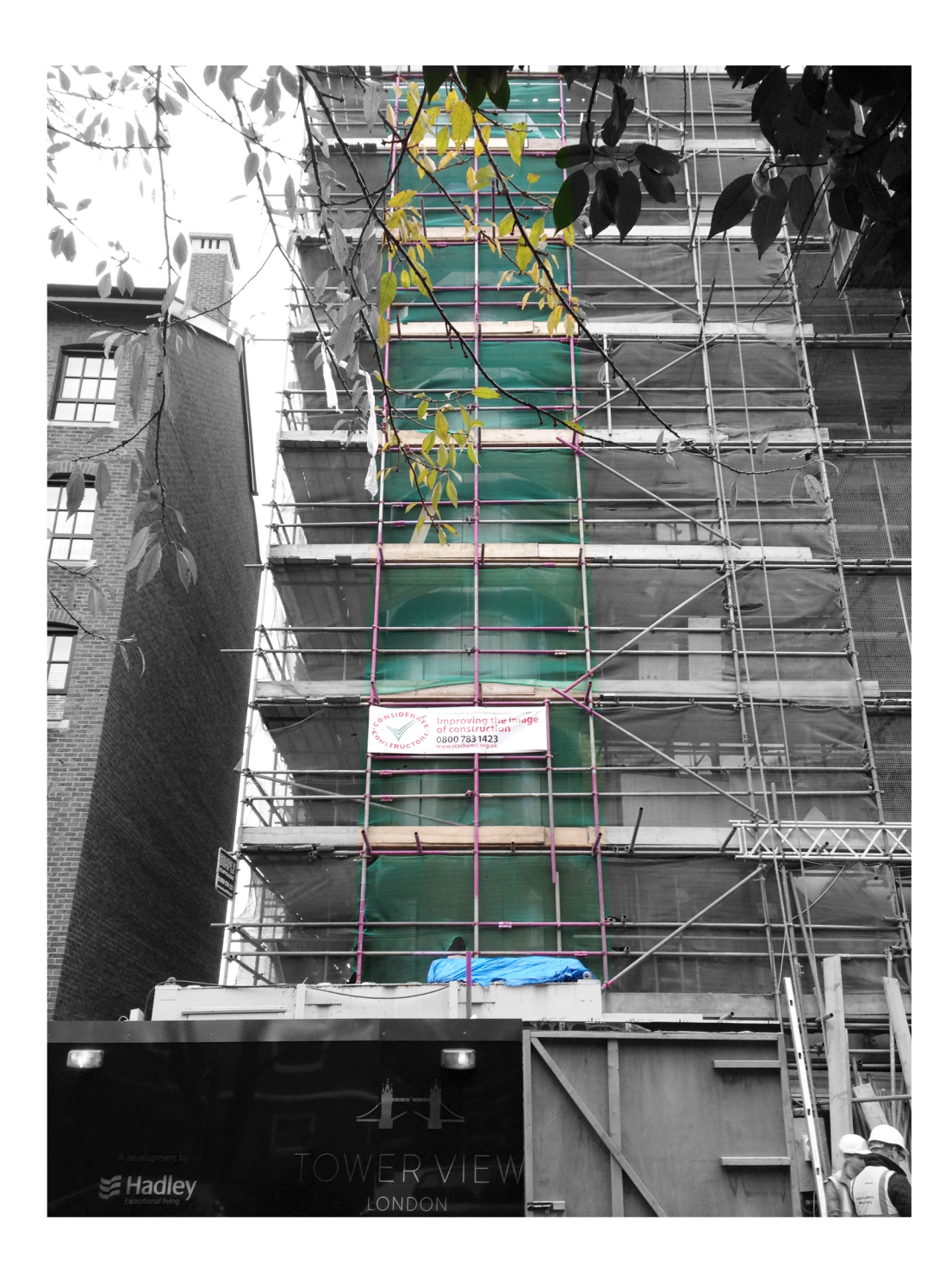
TS Week2 Daria Gavrilova