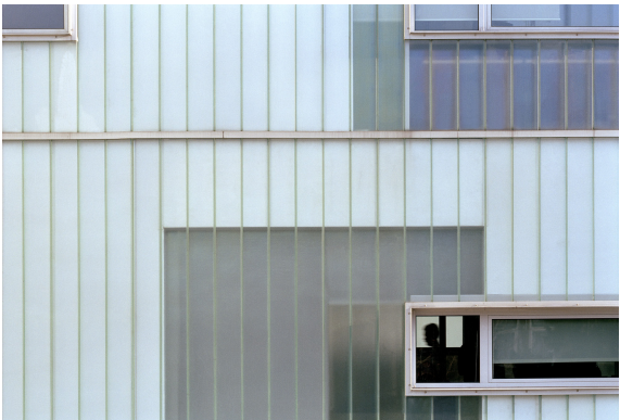
Above: close up of the facade The double-glazed facade allows higher thermal and sound insulation. In general, such facade comes with the variety of three systems; double-skin facades, mechanically ventilated facades, or buffer facades. Here, the principle of double-skin was applied. The ventilated cavity allows the exchange of fresh and exhaust air.