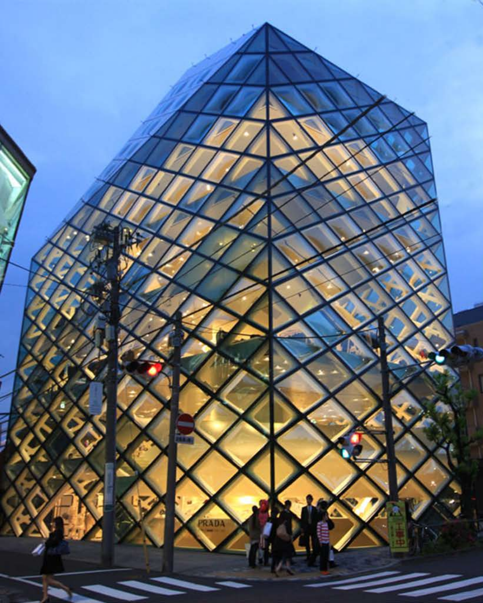
Prada Flagship Store in Tokyo Architects: Herzog and De Meuron